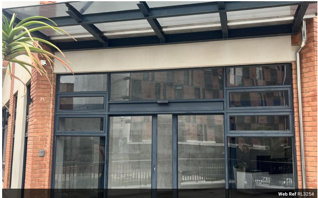
Web Ref RL3254

Shop 46 - Protea Mall 1 Lighthouse Road Umhlanga Rocks