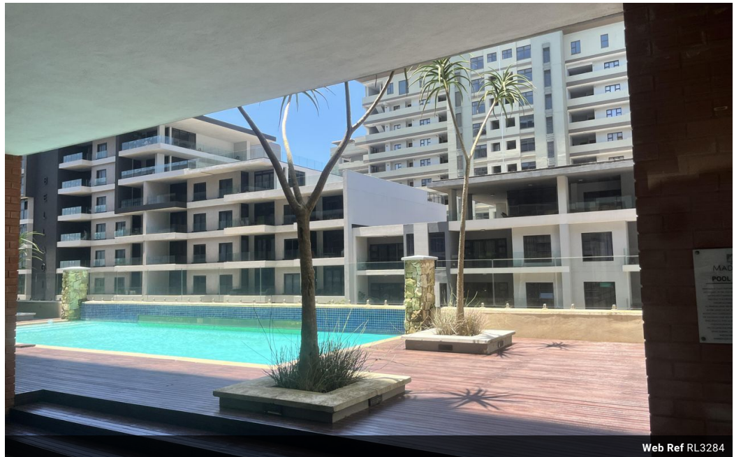
Web Ref RL3284

Shop 46 - Protea Mall 1 Lighthouse Road Umhlanga Rocks