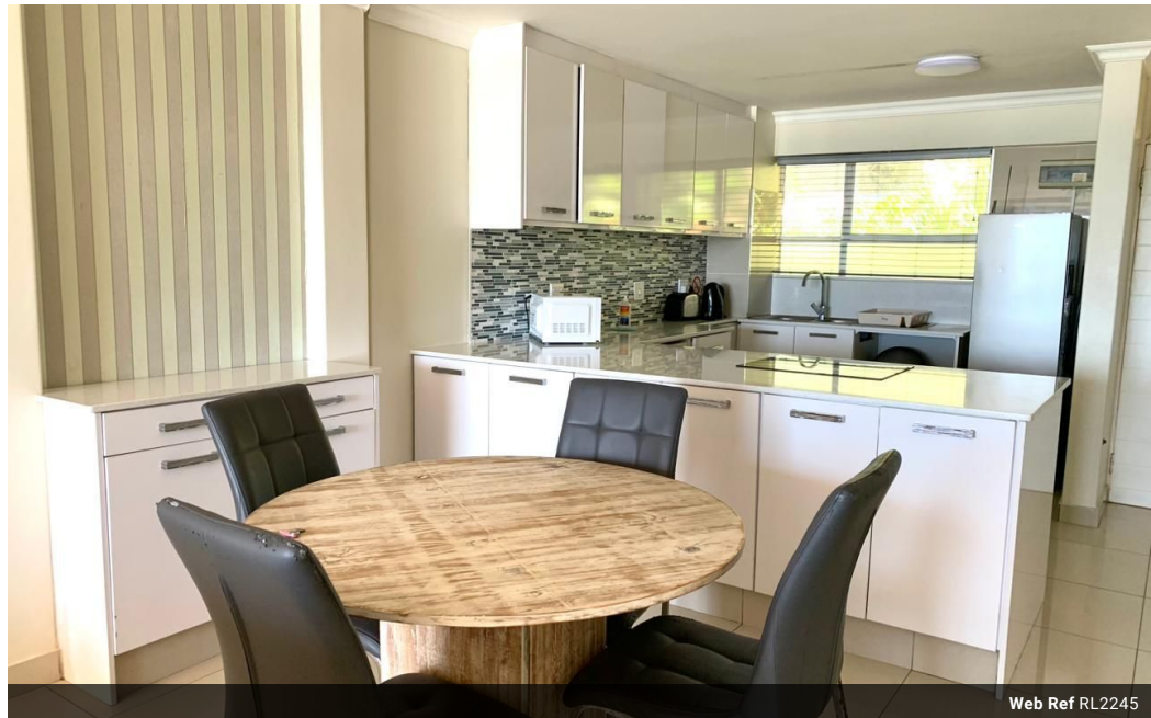
Web Ref RL2245

Shop 46 - Protea Mall 1 Lighthouse Road Umhlanga Rocks